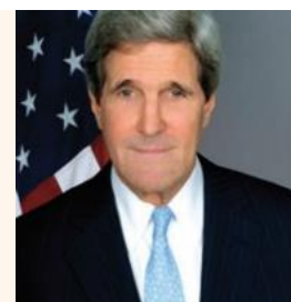
John Kerry Former U.S. Secretary of State

"When I first became a Senator in 1985, AIDS was a death sentence and few in positions of authority were willing to even say the word "AIDS." I remember the fear back then . . . But what I remember most is how everybody came together to overcome. Through PEPFAR, we are supporting life-saving anti-retroviral treatment for 6.7 million men, women, and children worldwide. We can take the fight to cervical cancer the same way we took the fight to AIDS. I'm proud to have Pink Ribbon Red Ribbon in our corner."